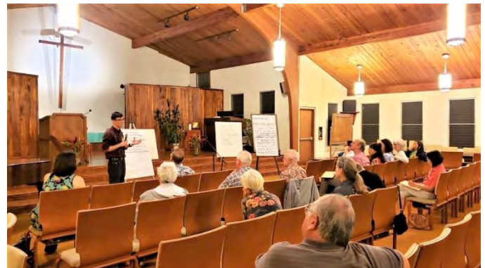
On Feb 26, 2019 he attended the Interfaith Community in Action (ICIA) monthly meeting. The focus of the meeting was ending homelessness and fear.