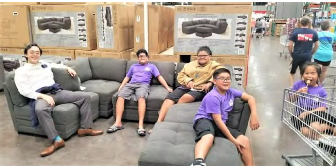
Gatha Fest done, Costco time!