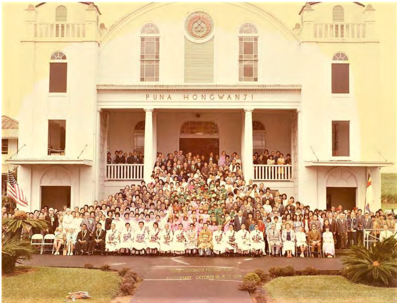
75th Anniversary of our church in 1976