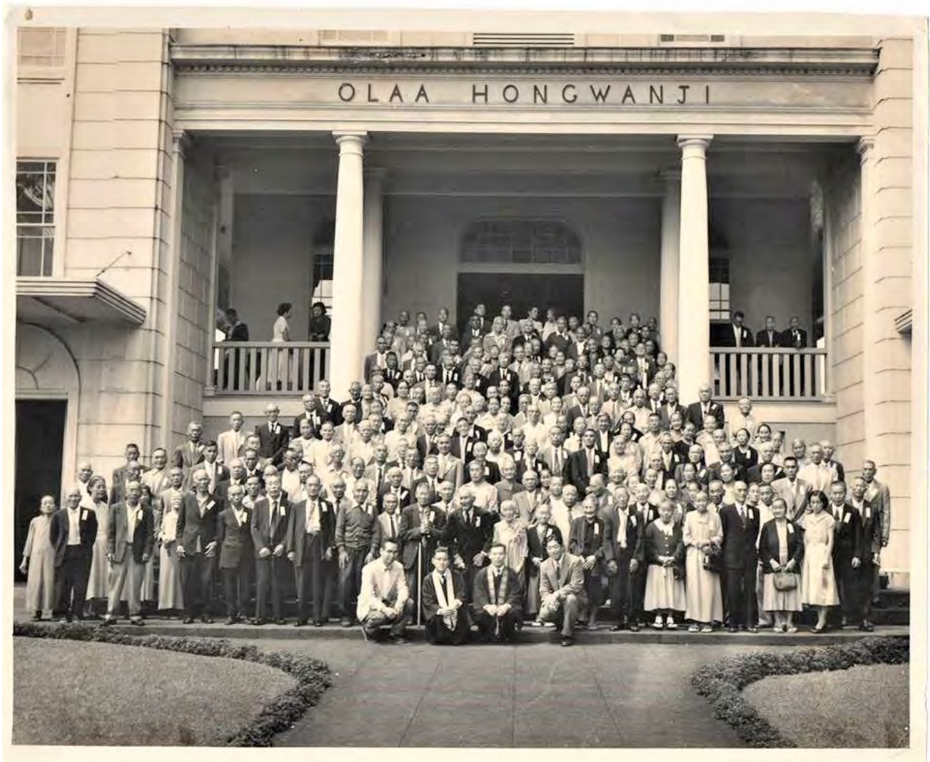
Olaa Hongwanji, before it became Puna Hongwanj in 1957