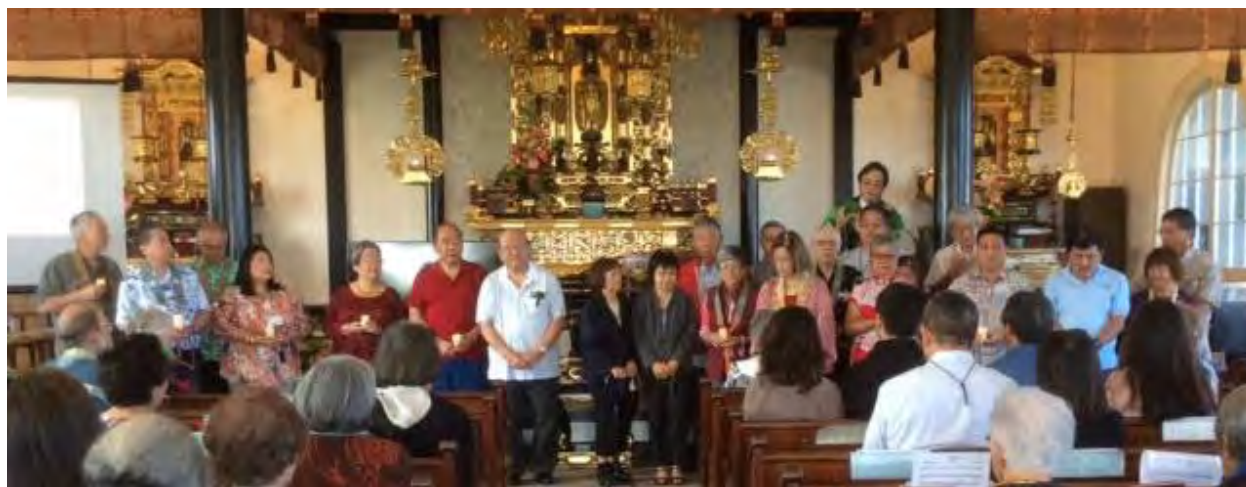
Newly installed Kyodan Officers, Board of Directors and Affiliate Presidents.