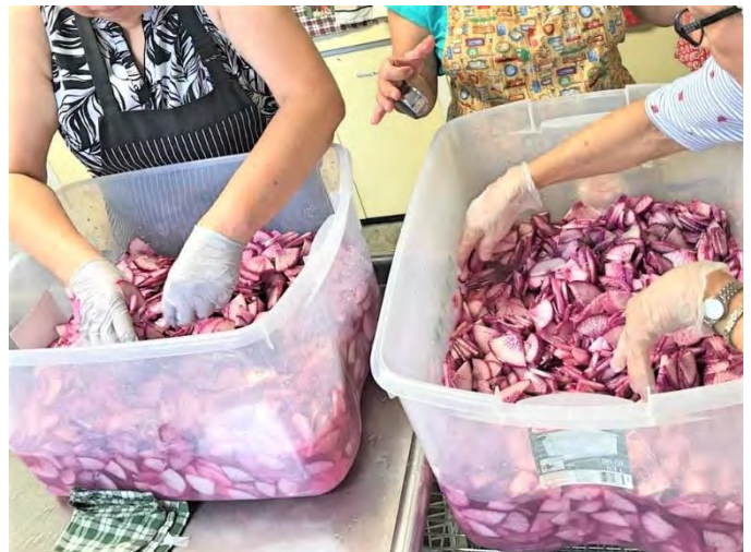
Soaking and mixing the daikon.