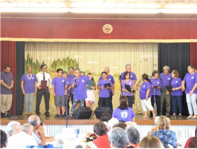
Puna Hongwanji members performing.