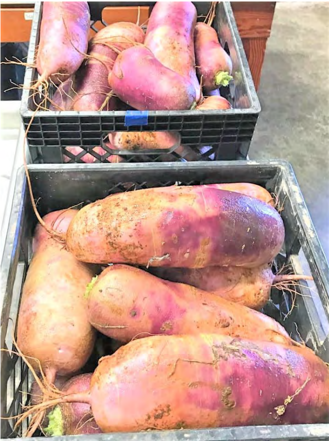
Preparing the purple daikon to make pickled daikon to be sold at the 2 nd Annual Puna Spring Festival.