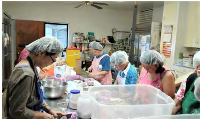
Everyone busy chopping the Daikon