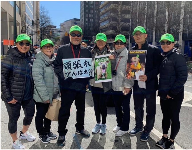
Her supporters that flew to Atlanta