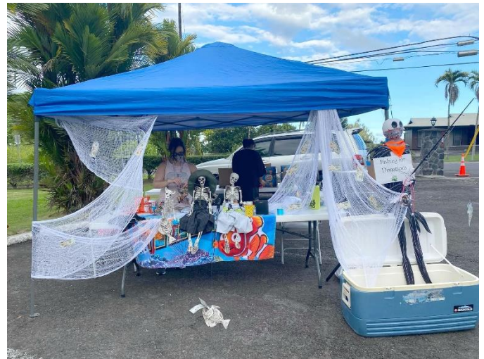
PUNA HONGWANJI KYODAN