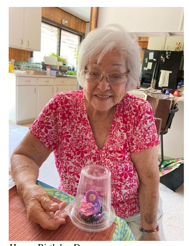
Happy Birthday Dora