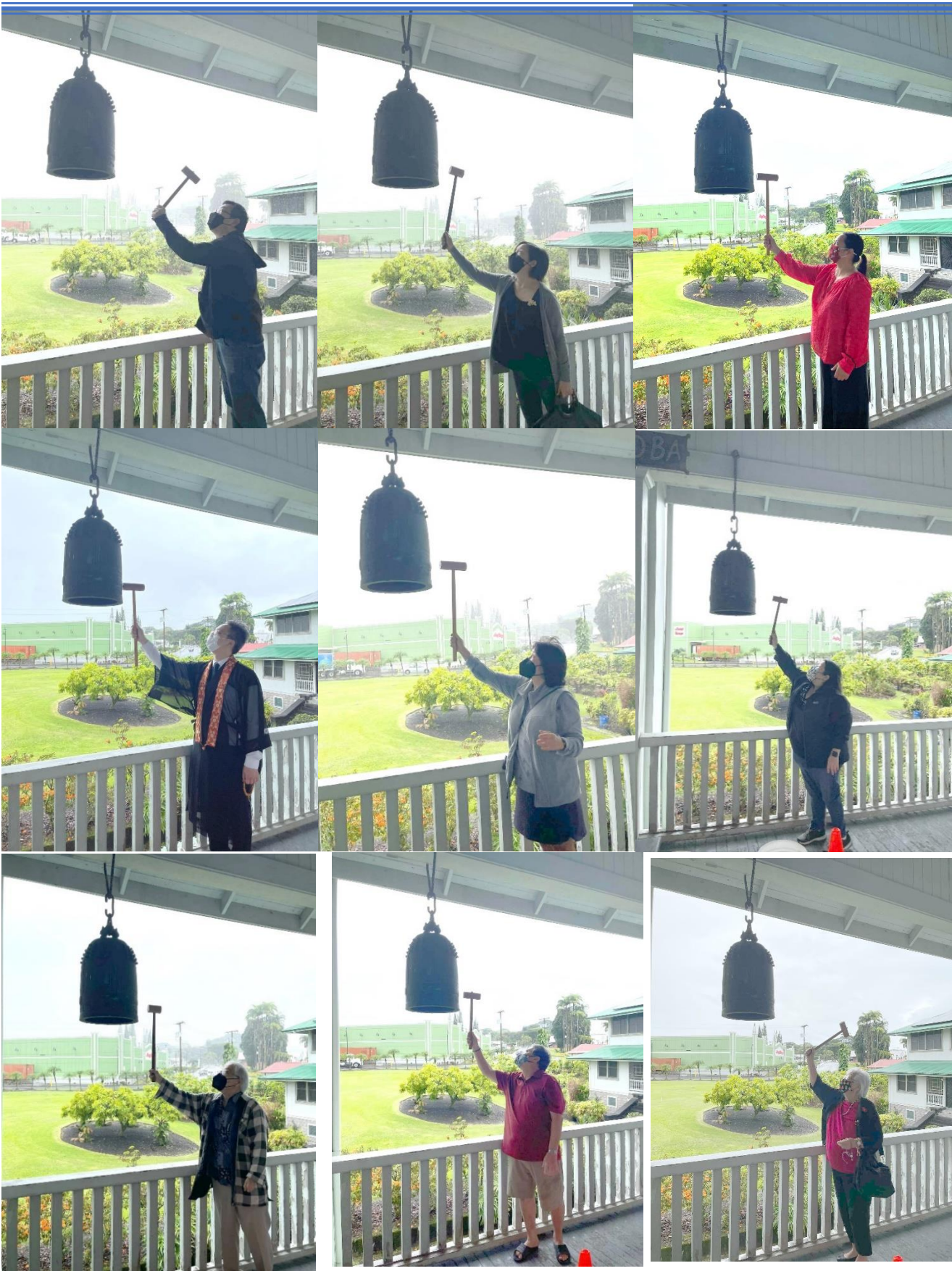
On New Year's Eve in the morning; it was a rainy day, but people still showed up to offer incense and ring the temple bell.