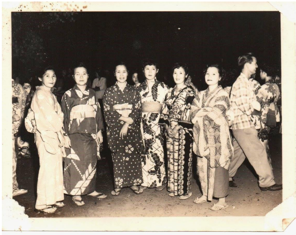
Flashback: Bon dance in 1952

Mail: P.O. Box 100, Keaau, HI 96749 Attn: Wedding