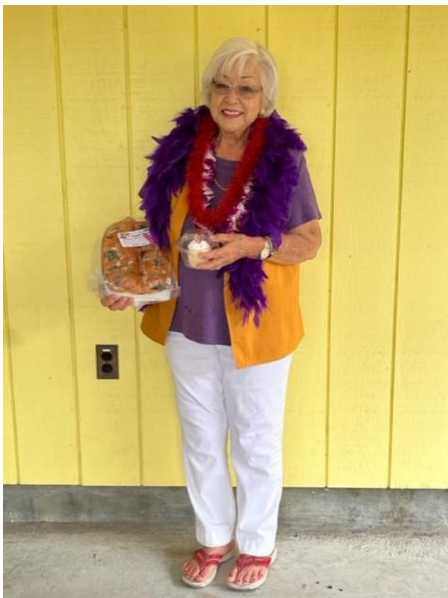
Happy Birthday Dora!